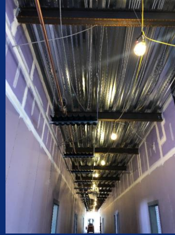
Overhead MEP work starting on main east