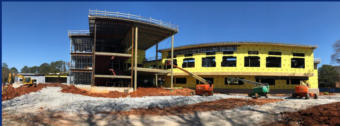
Photo of the project site from southeast corner, site of future playfield