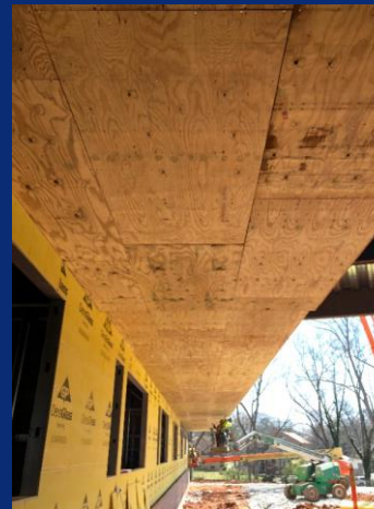
Soffit sheathing in progress on Elevation I