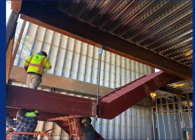
East stair install ongoing