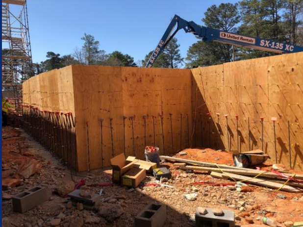
Form work for retaining wall outside of gymnasium