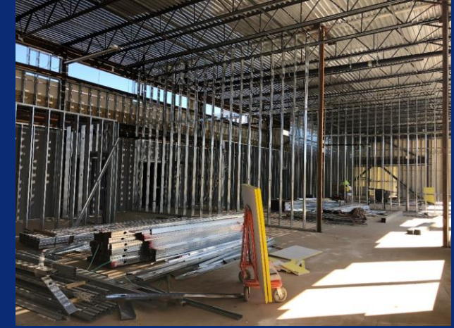
STEM lab and music room interior walls starting