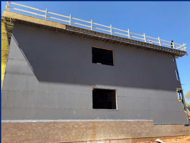
Fluid applied at east end of classroom corridor (Elevation H)