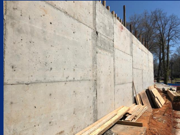
Retaining wall for ramp walkway at lower level entrance