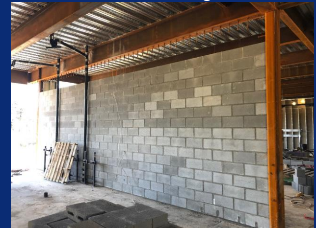
Block walls at 2 nd floor restroom in progress