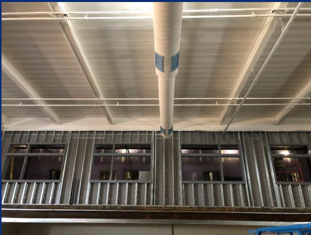
Interior HM window frames overlooking gymnasium installed