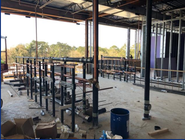
3 rd floor gang restroom rough in