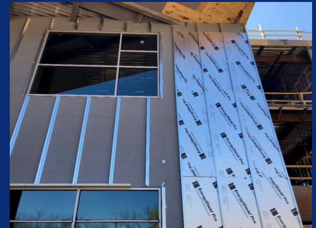
Z-girt installation for metal panels in progress on Elevation F